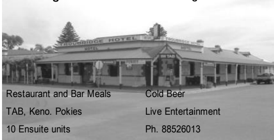
Troubridge Hotel / Motel Edithburgh

We enjoy ourselves, keep fit, play mainly doubles, share a joke, plenty of banter and go for a coffee afterwards and grateful we can still be active. The players are all ages and play to their own pace and love it. We have 3 courts and usually go for 1 hour, no need to ring just rock up when you can and don't forget to bring your own special sense of humour - you will need it.